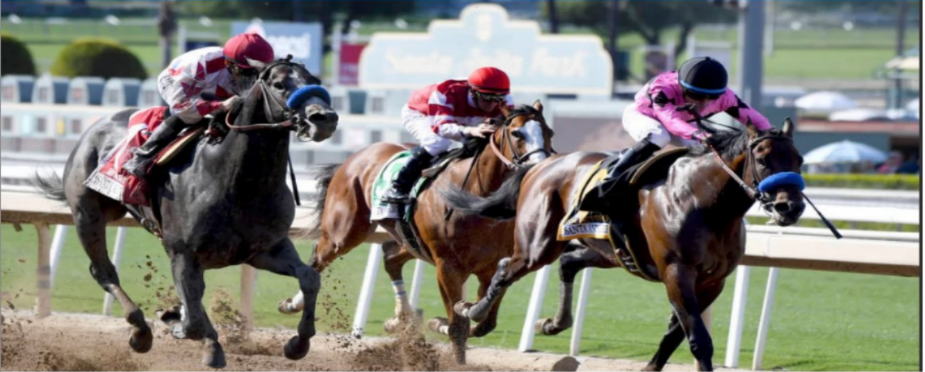
EXPERT HORSE RACING HANDICAPPING!